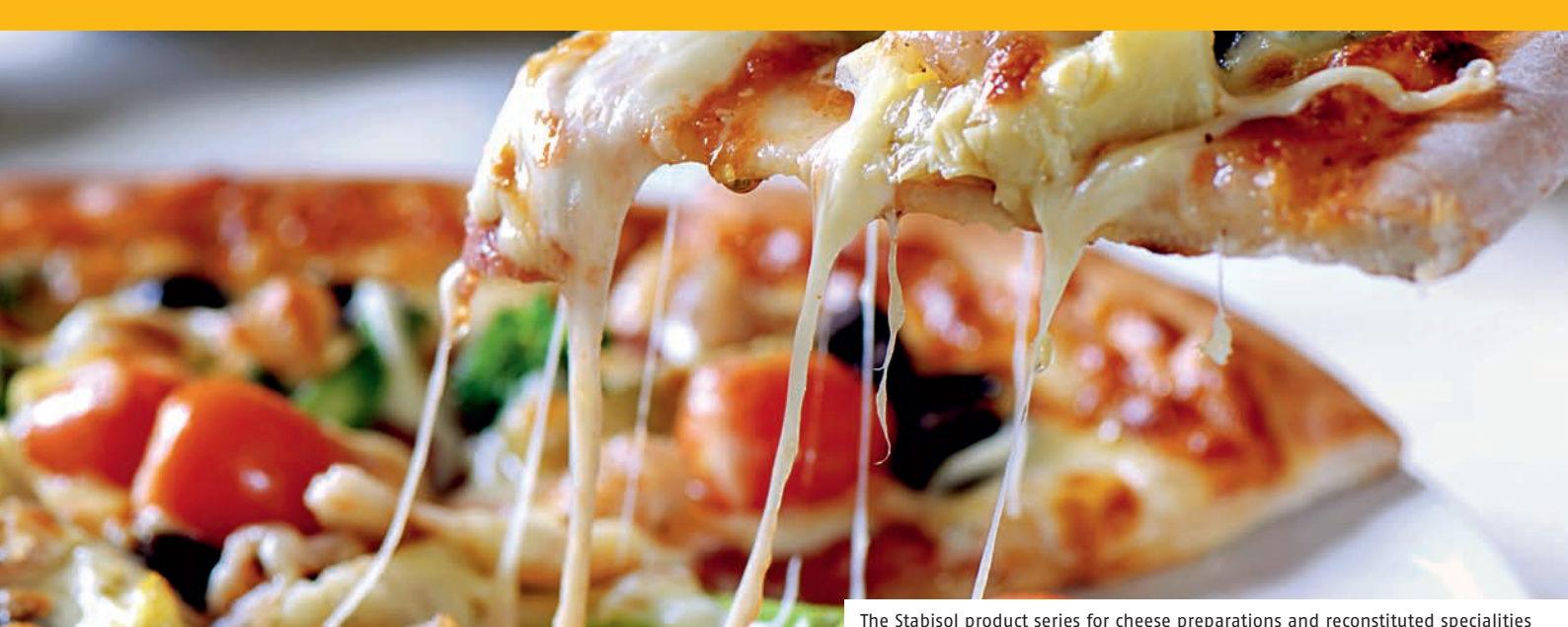
The Stabisol product series for cheese preparations and reconstituted specialities